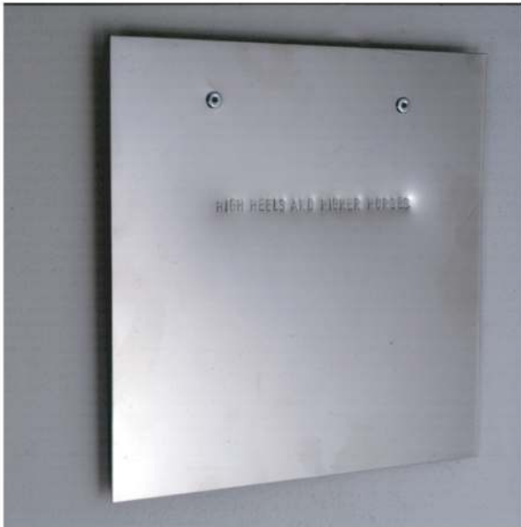
sale of the sentences project completed: Jan 99